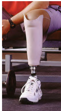
Transstibial PTB socket with locking pin suspension

A total contact socket enhances venous return, limits edema and reddening/inflammation on the distal end of the anatomic limb, and helps distribute the load somewhat.