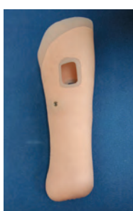
Wrist disarticulation inner socket