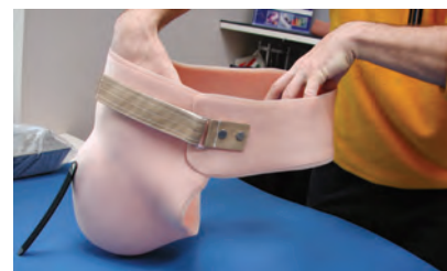
Short transfemoral liner with waist belt