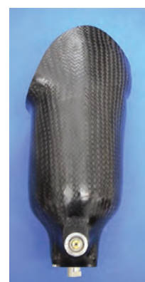
Laminated transtibial socket

Today’s below-knee sockets are of two primary types: The “old reliable” patellar tendon-bearing (PTB) design focuses weight-bearing stress on certain pressure-tolerant structures, such as the patellar tendon and medial tibia flare, and relieves pressure-sensitive areas. The PTB socket is still preferred by many patients, notably those with shorter or bony residual limbs. It generally is not a good choice for patients with residual limb scar tissue and/or chronic skin breakdown.