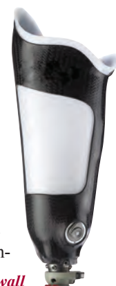
Double wall transfemoral socket

A hydrostatic weight-bearing socket is a specific version of the TSB design, cast in a compression environment to achieve uniform pressure distribution across residual limb tissues. This design encourages tissue elongation within the liner, increasing padding at the distal residual limb and reducing potential for skin breakdown.