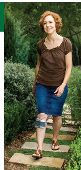
FES unit for drop foot