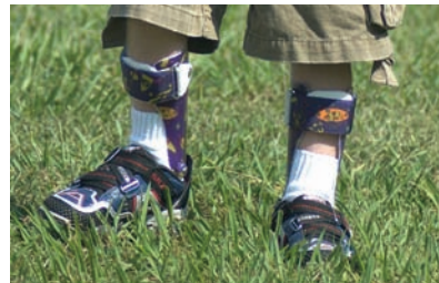
Pediatric articulating AFOs