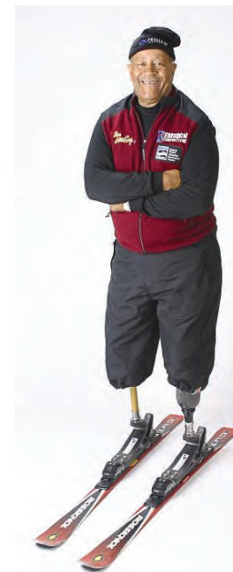
Athletes and active amputees should be classified K-4.

It is important that the physician record not understate the patient's potential function with a properly designed prosthetic limb. For example, a patient capable of walking with a variable cadence should be