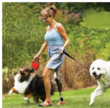
Amputees capable of walking with a variable cadence rate a K-3 or K-4 assessment.

As before the CMS change in policy, we are fully prepared to evaluate any patient's functional capability and recommend a prosthetic course of treatment to any of our referring physicians.