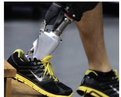
iWalk BiOM prosthesis

In place of the passive spring core of the typical contemporary prosthetic foot, the battery-powered BiOM incorporates microprocessors, gyroscopes and motors to sense the wearer's ambulatory purpose and respond with the appropriate positioning and force, effectively replacing the function of the absent calf muscle and Achilles tendon.